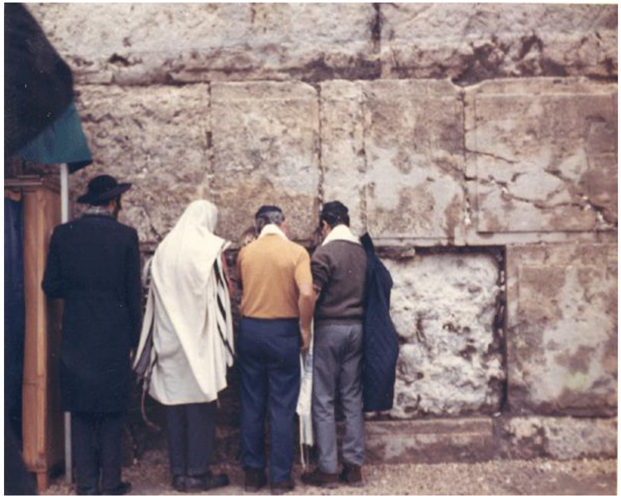
before the Wailing-Western Wall