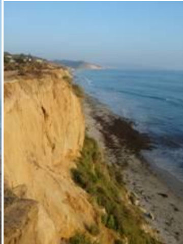
in front of our cliff house in a northerly direction toward Dog Beach,