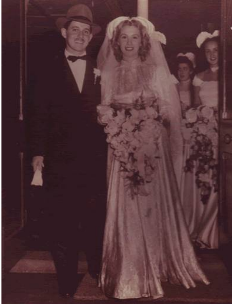
and virile father