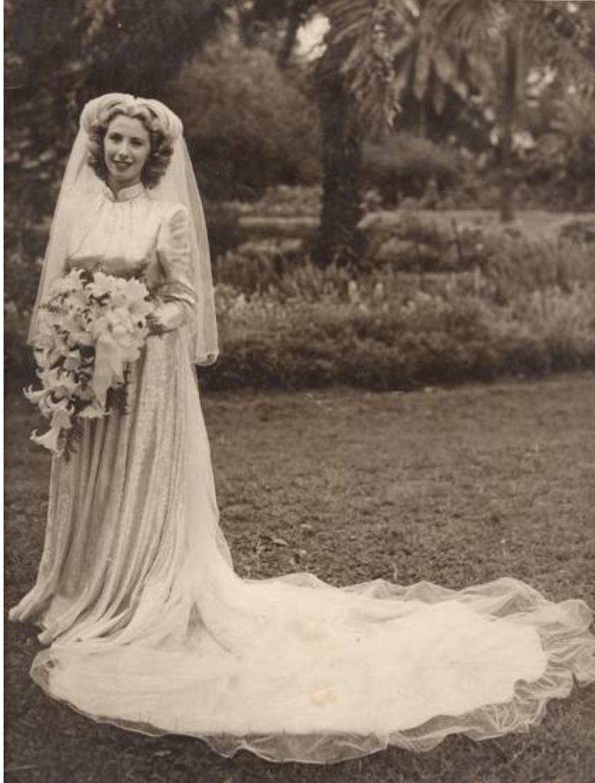
-Mother when still just 19 years of age and married less than 3 months to my good looking