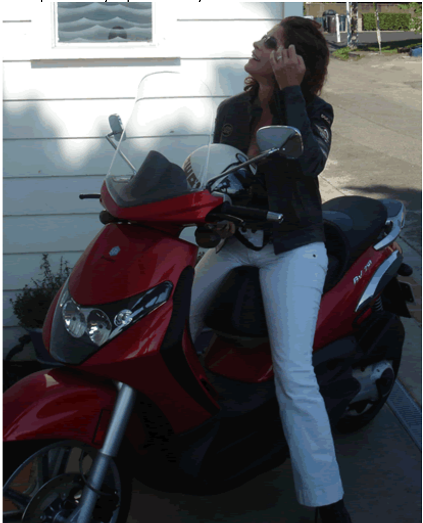
Time to think!