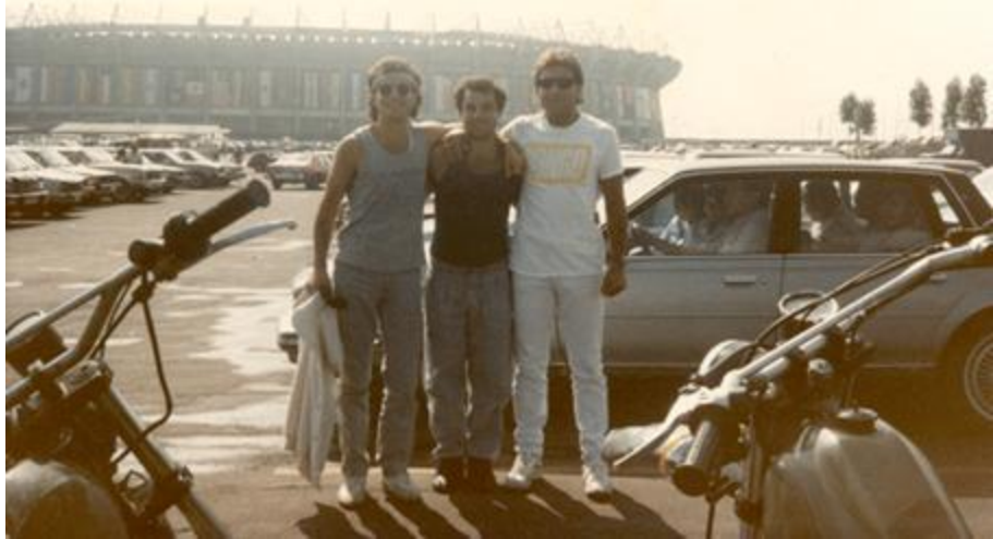
that had West Germany playing