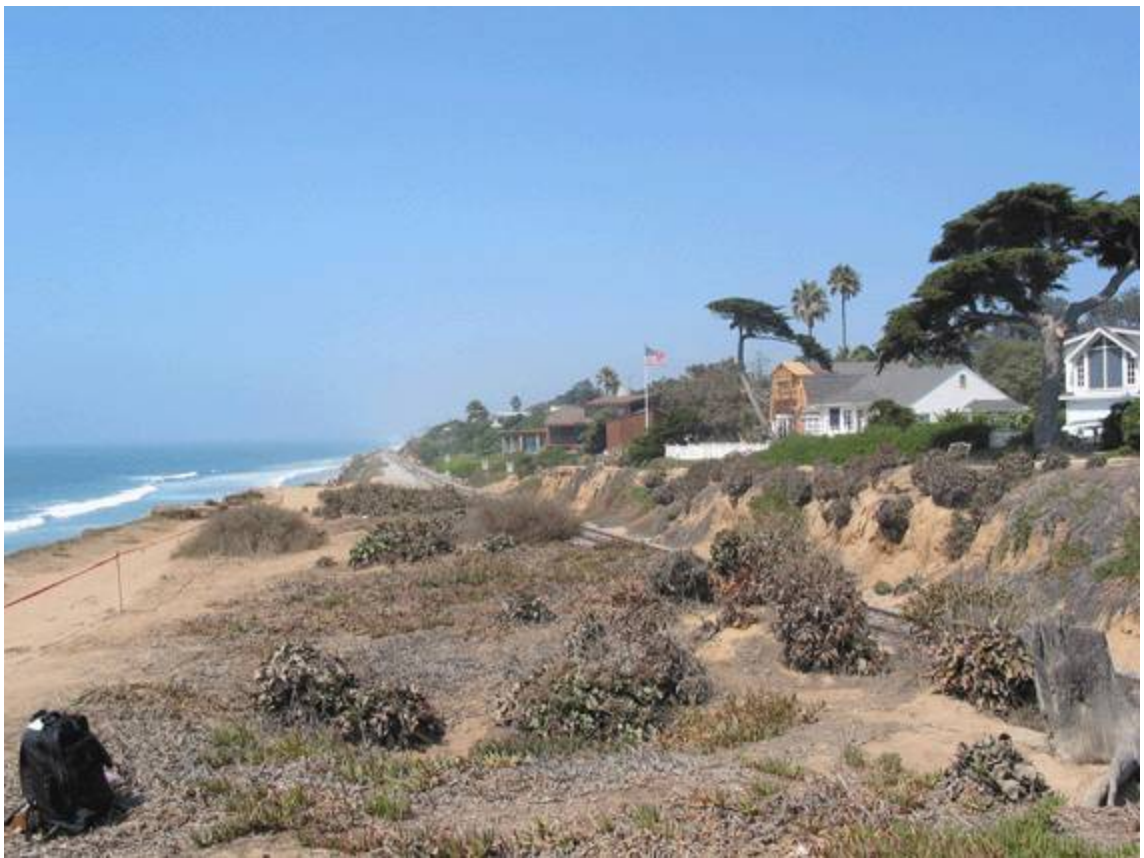
where in a worse case scenario he could jump in the water and swim to safety all the way to China, if necessary, responded, "But how would you breath given all the ash in the air?" to which I responded, "What is your better alternative?" which then had him letting me know that the authorities were sending them to the Torrey Pines parking lot on the beach, a mile west of where THE IT lives.