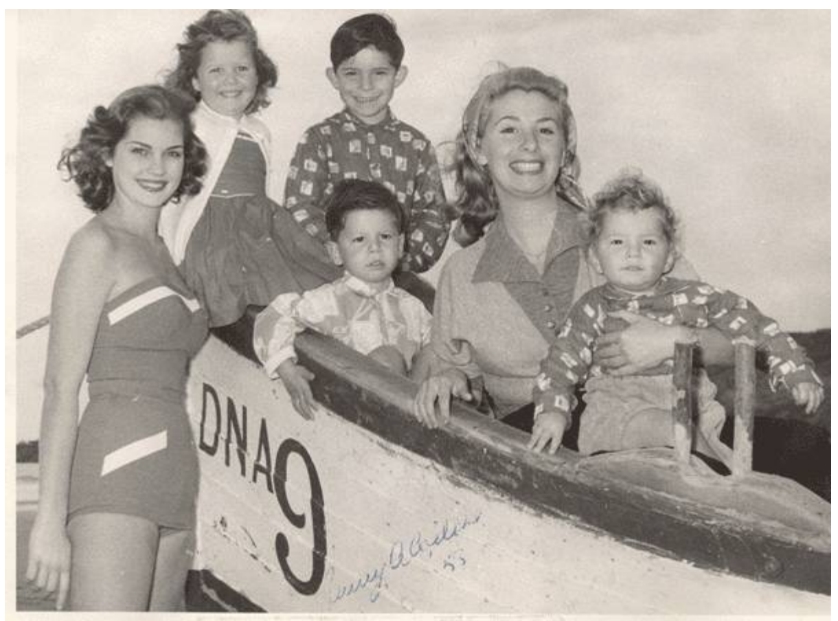
in the world, and my ever kind and gentle mother was not exactly a dog.