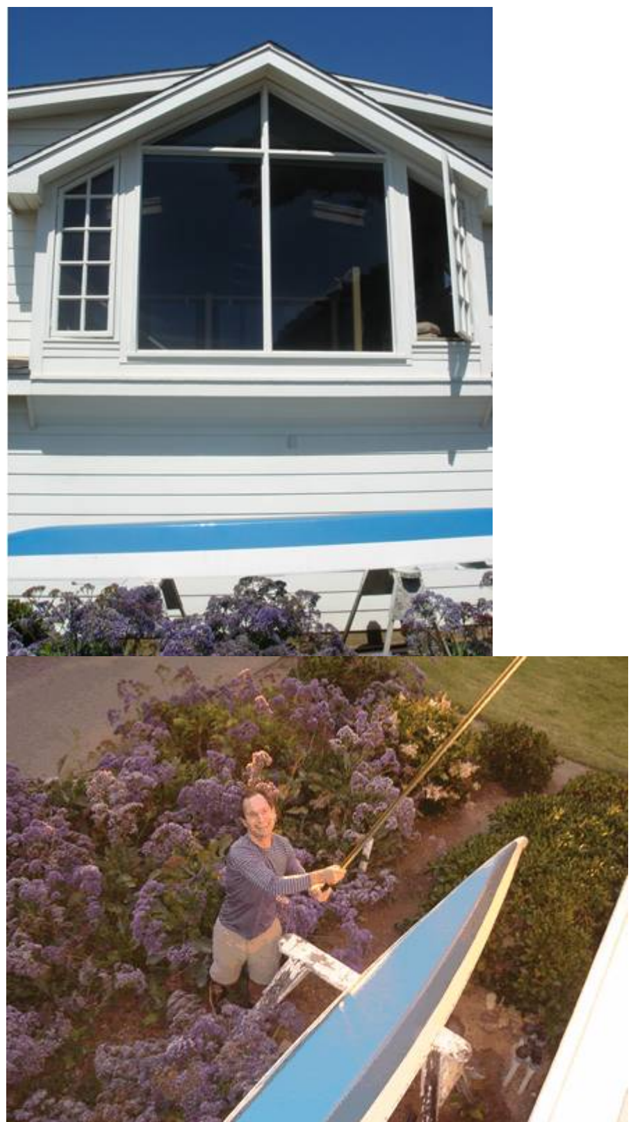
Not to mention what an awesome morning the two of us spent since the " crack of <u>dawn</u> " watching the seagulls fish enmasse in the Pacific Ocean right in front of our "getting there", almost completed major refurbishment art and love filled, increasingly void of all