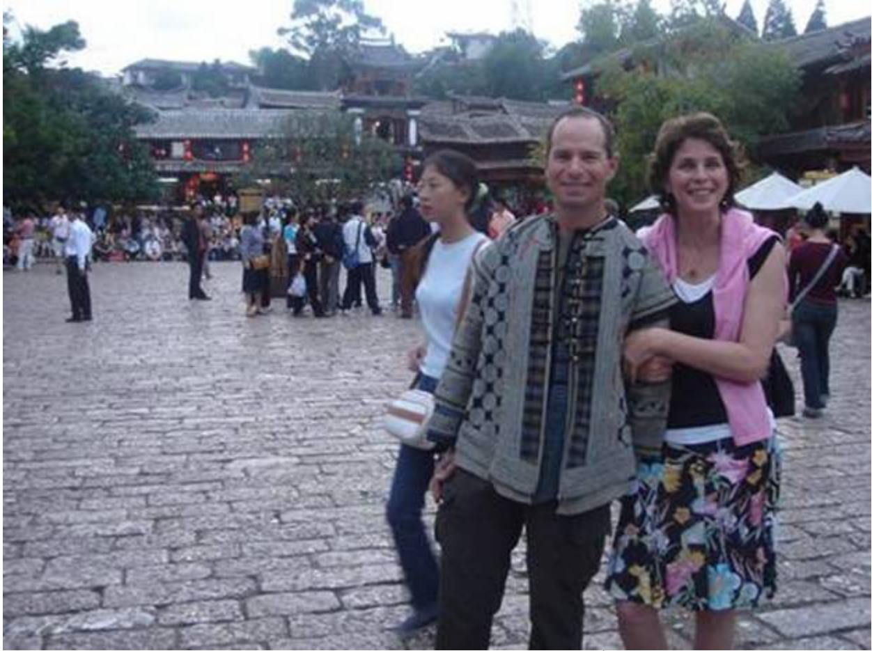
that the US civil war, making the American Civil War of the mid-19<sup>th</sup> Century look like a day in the water park, could spread rapidly to the shores of China; increasingly less so as time passes and most importantly Knowledge-Information-Light travels at Light-G-D-

But of course you, a very distinguished Anti-Trust litigator perfectly understands that for American politicians to tell it exactly the way it is would have meant back in December 2006 no different to today, nothing short of civil war here in the US and for the Chinese only to be concerned, ever since getting their arms around the cause of the Tiananmen Square Massacre of June 1989 when I first visited China