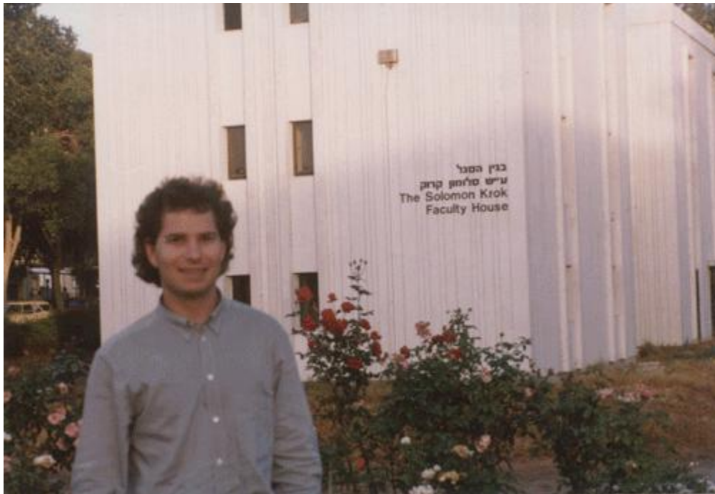
Not to mention that my Royal Mother-Mater,