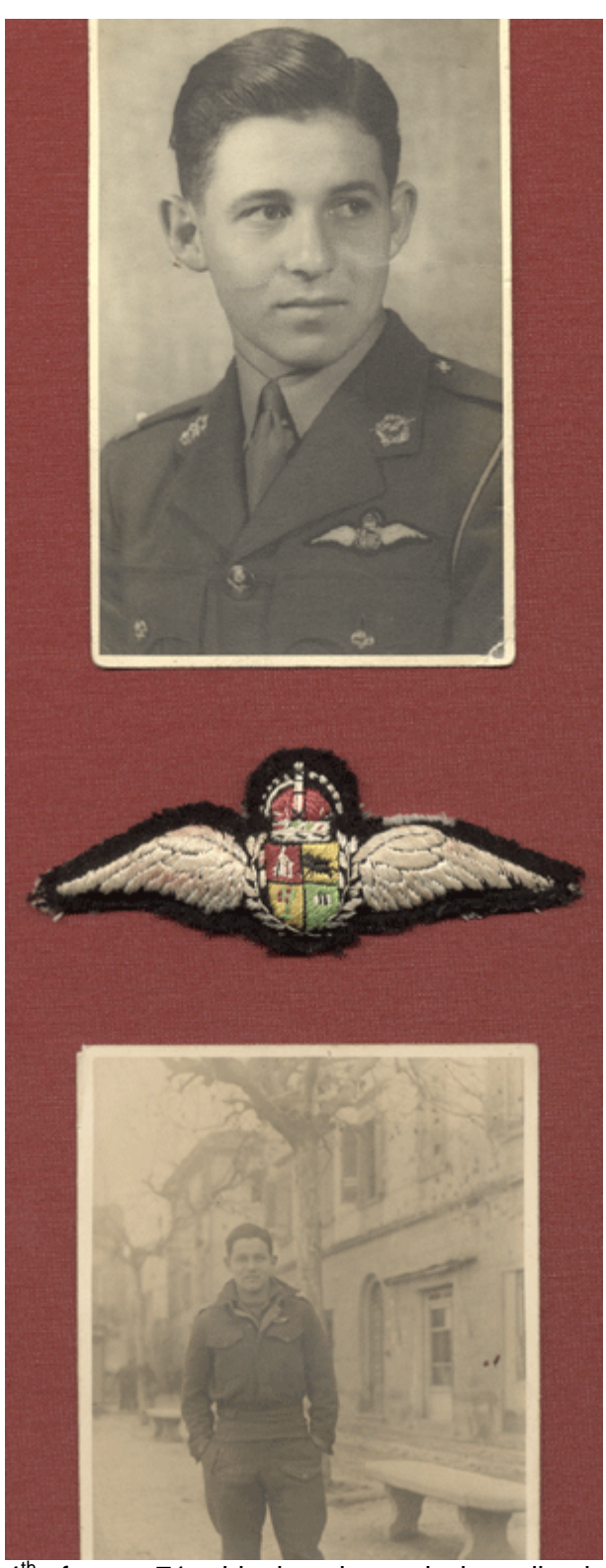
4<sup>th</sup> of some 71 odd miraculous missions dive-bombing the crap out of the DAAC Nazi bastards who had by December 4<sup>th</sup>, 1945 not only fully infiltrated British and American military intelligence but had shared such intelligence with the DAAC Nazis that of course provides the best explanation of why General Eisenhower kept in his shirt pocket a speech he planned to give had D-Day June 5<sup>th</sup>-6<sup>th</sup> 1944 been a "disaster" which of