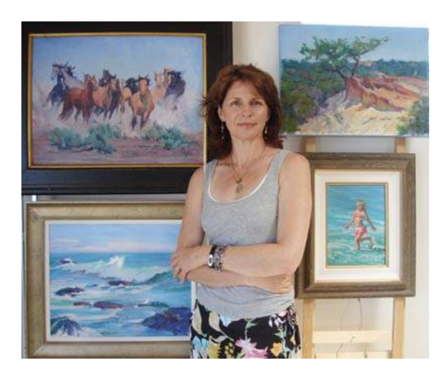
that Sebastian displays in the photo below