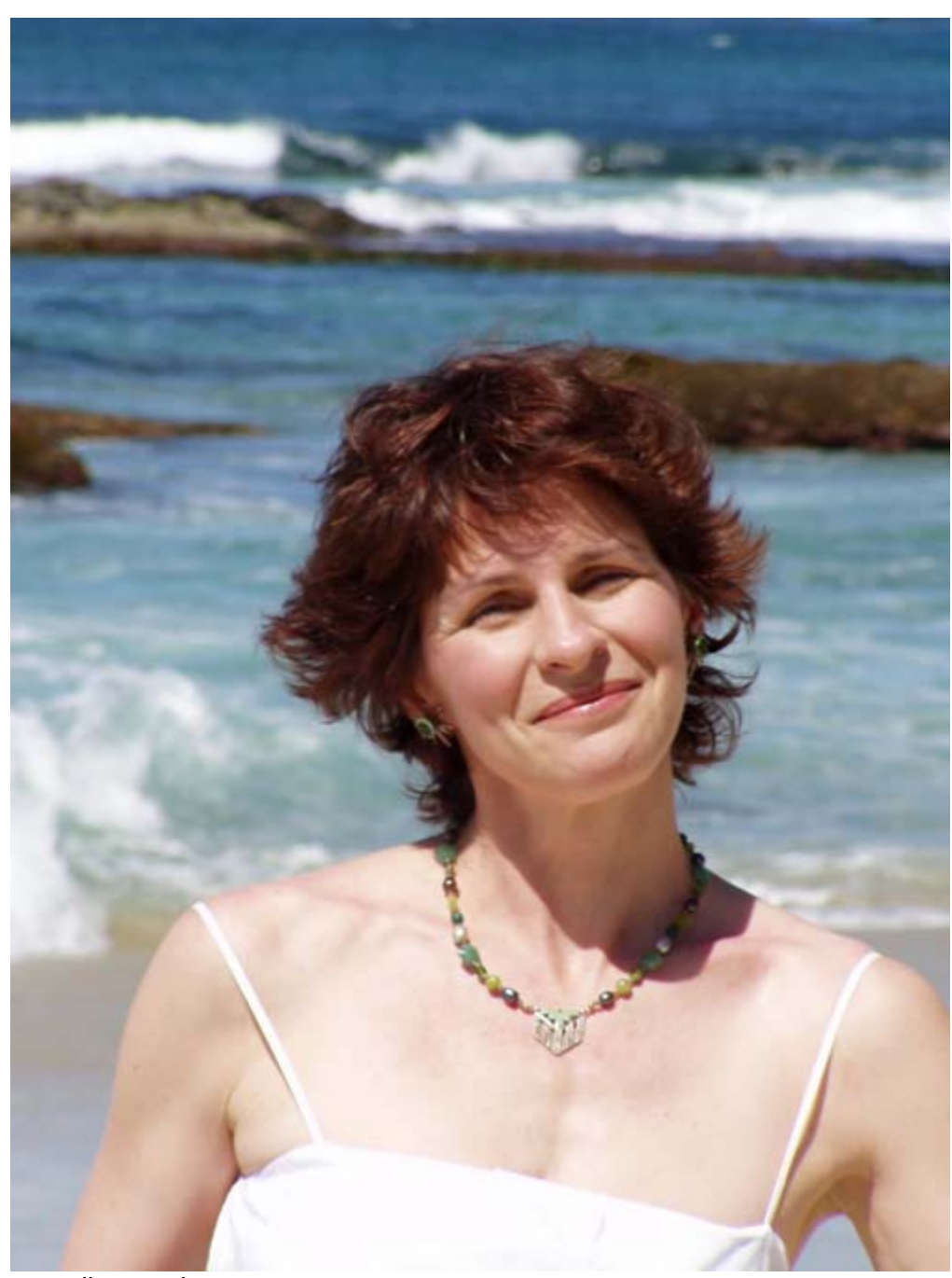
as well as sexier