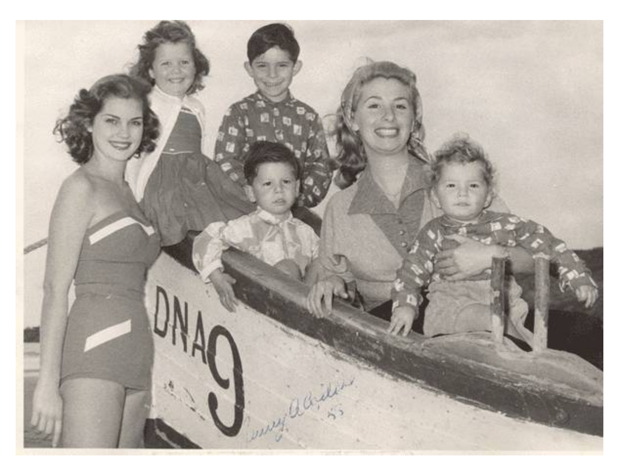
freezing her buns off on Durban South Africa's south beach shortly after she won the Miss World competition in 1958, beating a Canadian who my mother thought was more beautiful