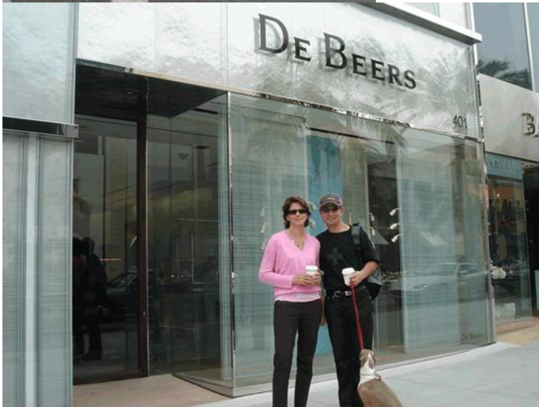
Beverly Hills, California.

Not to mention both the IMF and the World Bank from their very beginnings, going back to the July 1944 Bretton Woods Conference, all about intimidating the 730