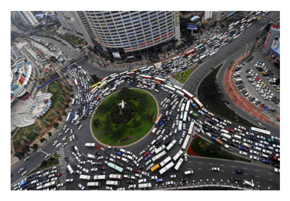
... while horrific traffic jams are a sign of its present and future

Canadian authorities were recently alarmed to find the Chinese interested in exploring the Arctic Ocean, in a bid to get a share of the minerals beneath the thawing icecap.