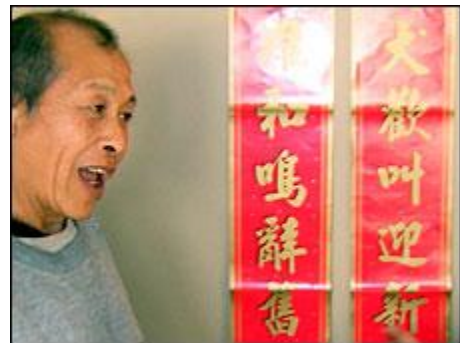
Chinese activists say they also fought against apartheid