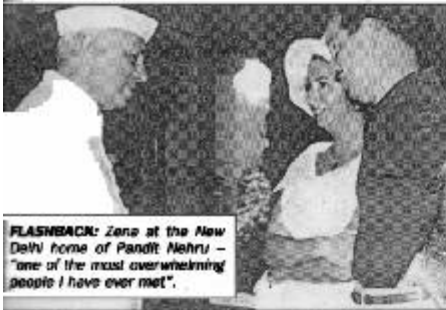
FLASHBACK: Zena at the New Delhi home of Pandit Nehru - "one of the most overwhelming people I have ever met"

"Men never grow up and very immature emotion. They can be extremely successful in science or other academic areas, but women are mature and can achieve much. After all, we have children - and what is greater than that?"