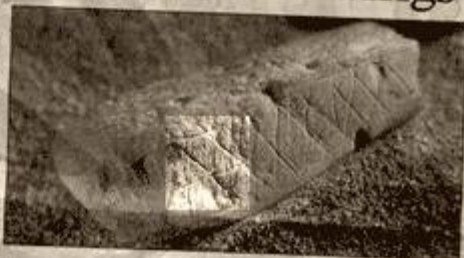
The stone with 77,000-year-old etching was found in a cave in a cliff on the coast of South Africa overlooking the Indian Ocean.

Henshilwood said the coastal hunters who occupied the cave had advanced more quickly use of a rich seafood diet. He is evidence to suggest that coastal civilizations often