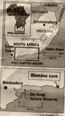
Los Angeles Times

'Is it art, or somebody with a stone tool just sitting there scratching?'