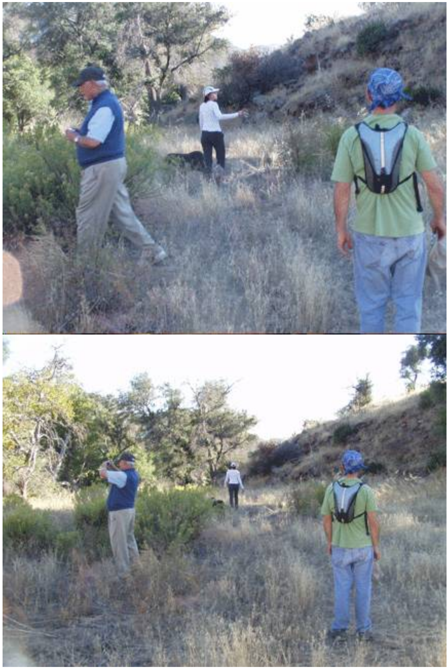
even if it is only for a couple of days at our sacred Stone Home, not to convince her or her mother; on the contrary to get you to see up close what a life