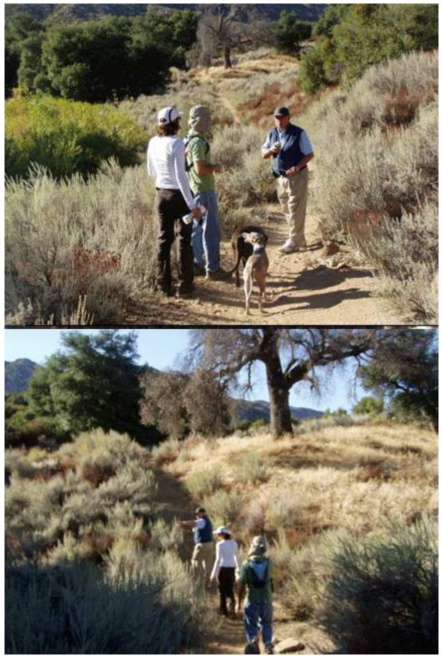
of an ant is all about.