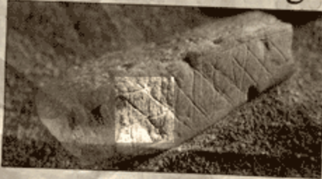
The stone with 77,000-year-old etching was found in a cave in a cliff on the coast of South Africa overlooking the Indian Ocean.

Henshilwood said the coastal hunters who occupied the cave had advanced more quickly to use of a rich seafood diet. There is evidence to suggest that coastal civilizations often