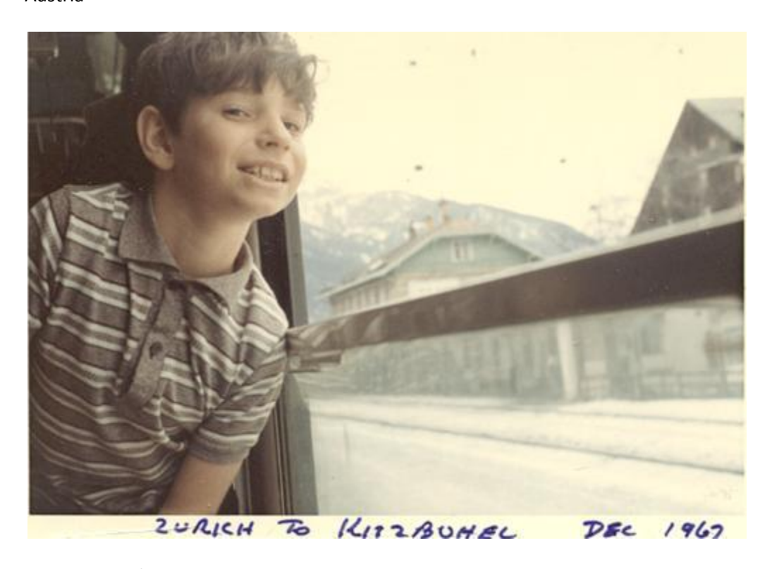
Although my father was on this trip and possibly took both photos below

Below is a photo of me looking out the train window on our way from Zurich, Switzerland to Kitzbuel Austria