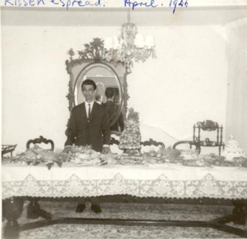
Kissen spread. April. 1946