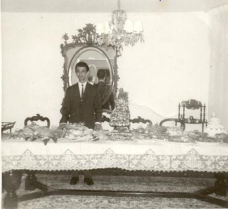
Kissen spread. April. 1946