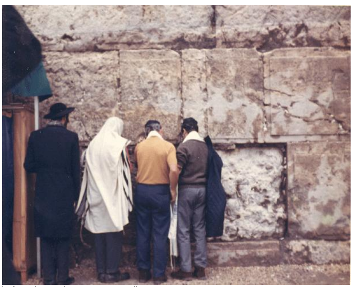
before the Wailing-Western Wall