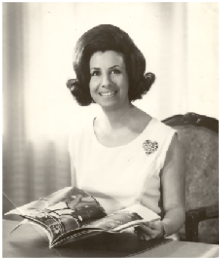
Anglicized, anything but Jewish looking