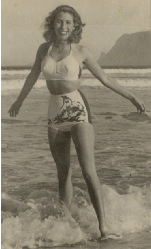
and most brilliant