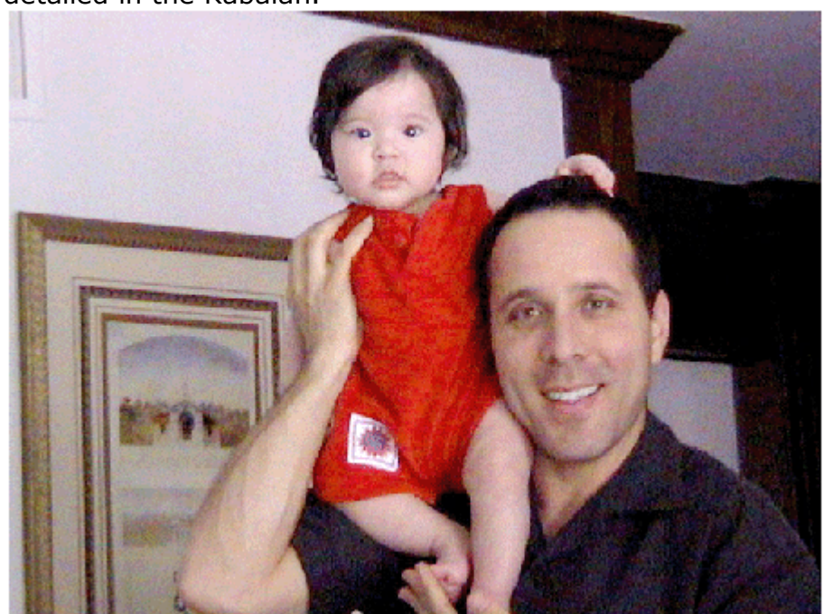
A little tired but happy looking former Maritime Israeli Special Forces - Flotilla 13 - commando and his Chinese-American daughter.

China has the military second-to-none and the world's very best military, the Israel Defense Force, don't have the best military intelligence in the world just because its best Special Forces commandos "shoot true" and who figured out when recognizing well prior to the start of Israel's War of Independence 1947-1949 that the De Beers controlled US Government was no friend of the fledging Jewish State, to look for equally hard working and ingenious friends within the Jews of the Orient, well detailed in the Kabalah.