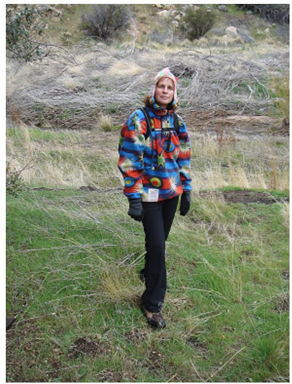
In the meantime think about this.

Create your own job by creating a problem that is too big for the masses to understand.