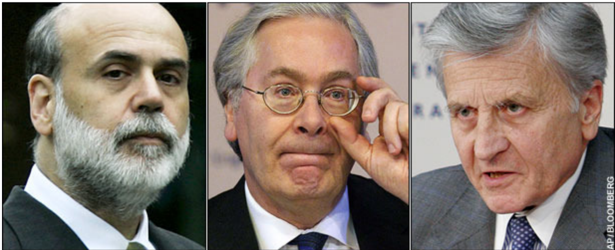
Faces of power: The Fed's Ben Bernanke, the BoE's Mervyn King, the ECB's Jean-Claude Trichet

As the credit paralysis stretches through its fifth month, a chorus of economists has begun to warn that the world's central banks are fighting the wrong war, and perhaps risk a policy error of epochal proportions.