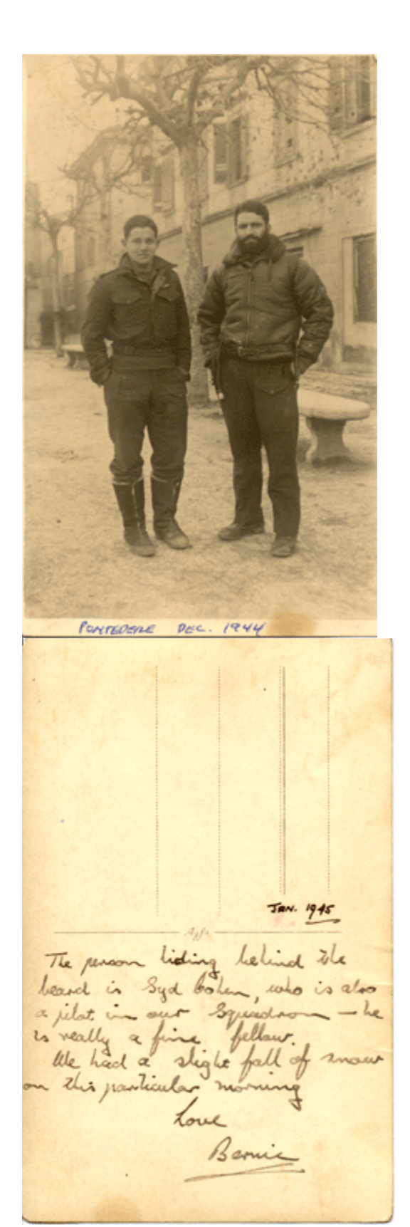
a founder of the brutal Israeli Air Force and Commander of Israel's first squadron during Israel's War of Independence which the Jewish Underground, headed by