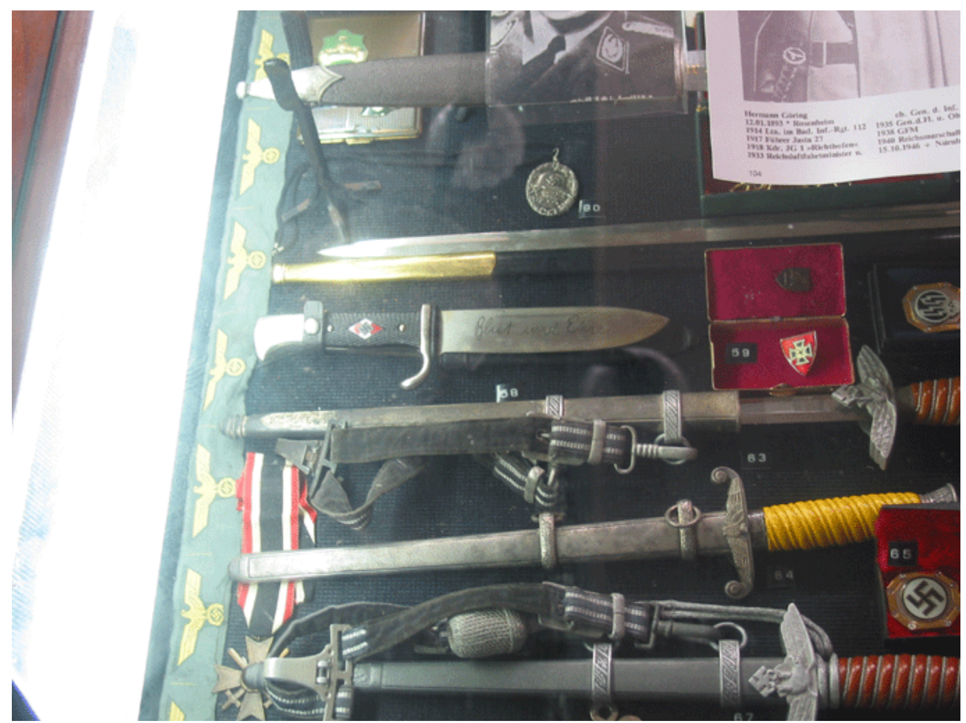
Donate to www.just3ants.com