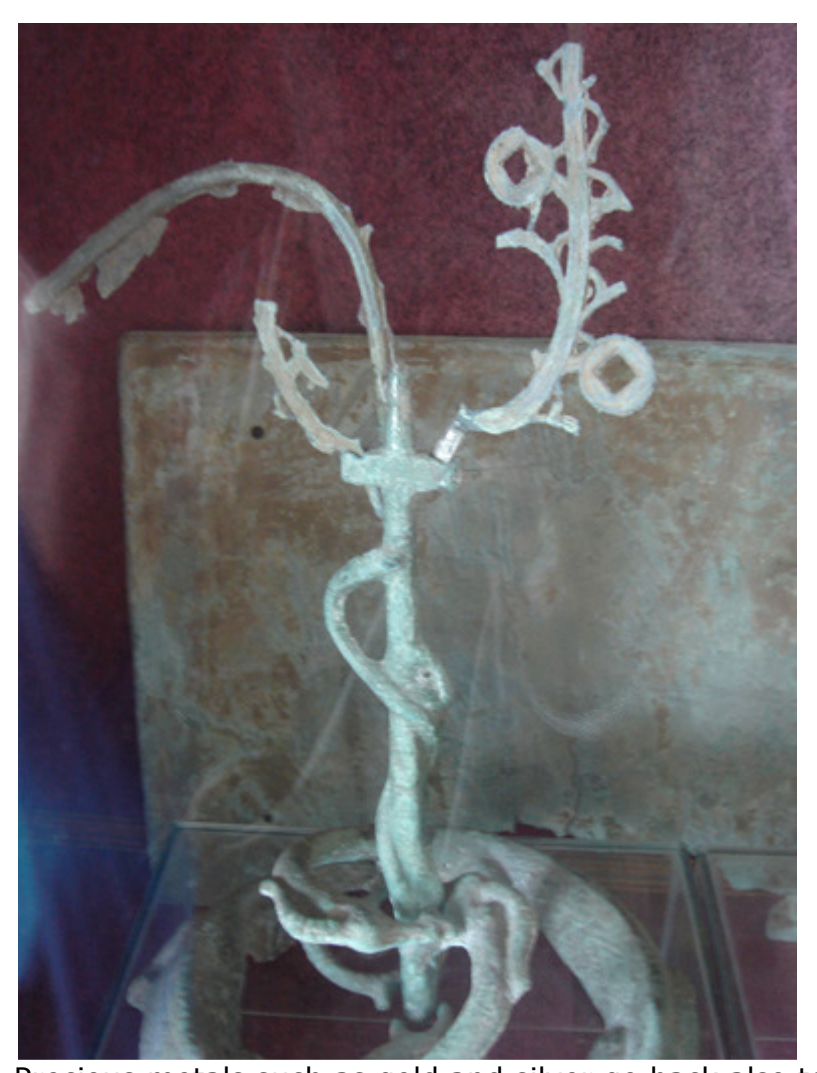
Precious metals such as gold and silver go back also to Biblical times.

Beginning at the end of the American-Anglo Boer-Farmer War of 1899-1902 a problem developed since the atrocities committed by the American financed British armies when placing Afrikaner old men, women and children in to Concentration Camps, and some 20,000 of them as well as 10,000 Black South Africans dying of thirst and starvation, began reaching the increasingly better educated British masses whose conscience told them it was wrong; moreover, if maintaining the Holy Roman British-American empire meant such brutality on the foreign battlefields then "to hell" with the entire concept of "Empire-Nation building".