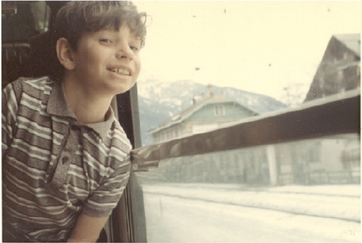
ZURICH TO KITZBUHNER DEC 1967