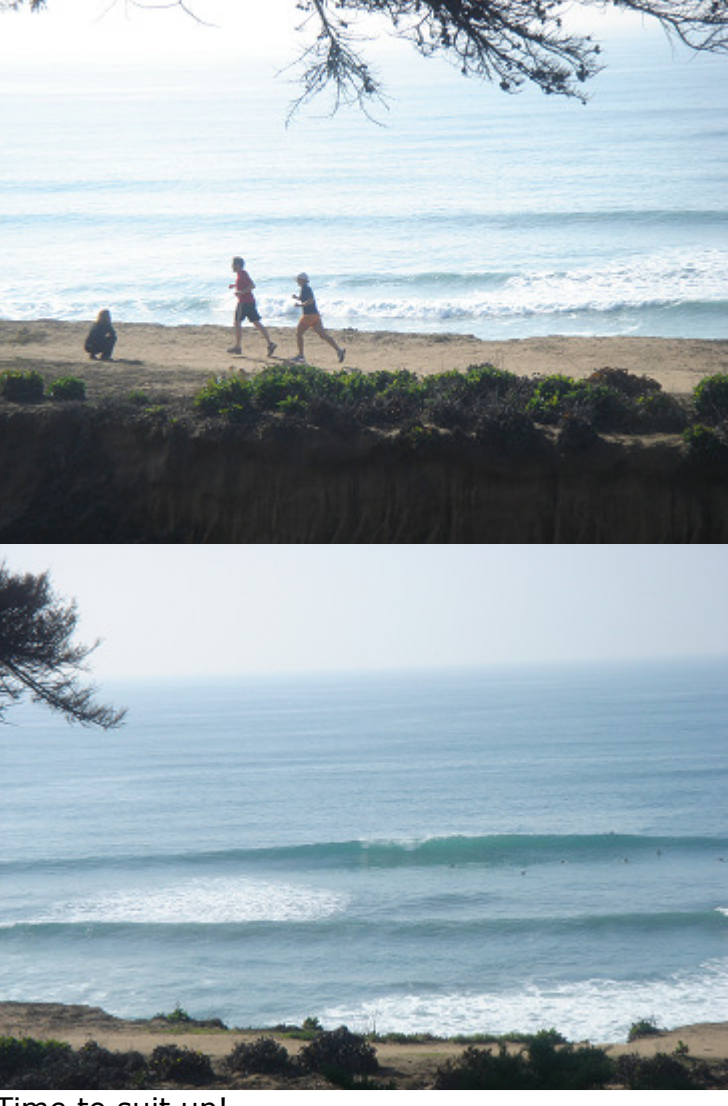
Time to suit up!

Right this minute the surf in front of our rented studio cliff house is pumping big time and the few surfers braving the waves are well above average that makes it even more enticing for me to do out on my wave ski since I don't have to worry that much about neophytes who are increasingly congregating along the cliffs of heavily corrupt real estate and city council Del Mar witnessing one most awesome spectacle of G-D-Nature.