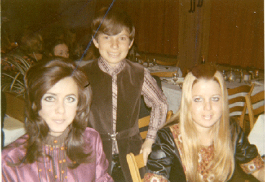
Arosa Hotel, Arosa, Switzerland when either before or after the evening's celebrations where we were all "dressed to kill", I shot up our hotel suite with a handheld pellet gun my Royal Mater-Mother had purchased for me in London,