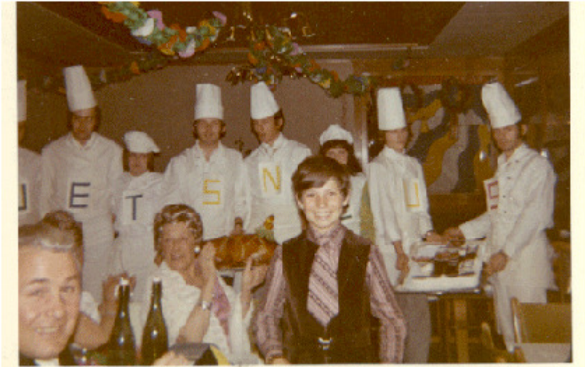
NEW YEAR AT CENTRAL HOTEL AROSA