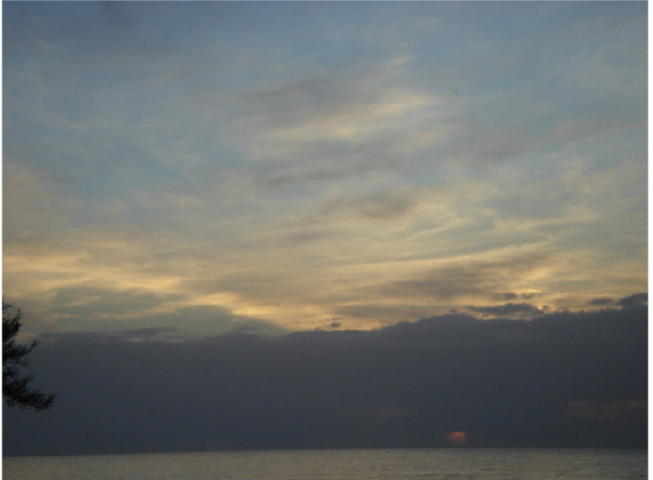
Right now the ongoing sunset is so very dramatic it is impossible to describe let alone photograph but I am going to try with the video camera.

Suffice to say I think I know exactly how wonderful it is going to be to die and go to heaven upon earth, now and forever.