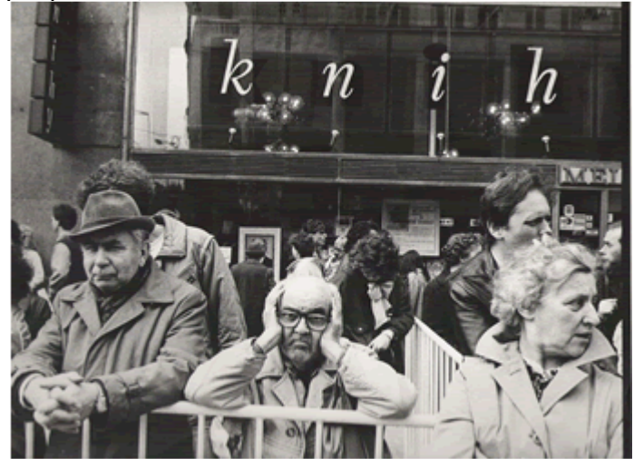
find an X equally perplexed, be quiet, have sex, talk to the trees, feed the birds who see the forest to hide amongst the trees whistling.

Why would you go on and on versus not responding to sensible material. Notice no question?