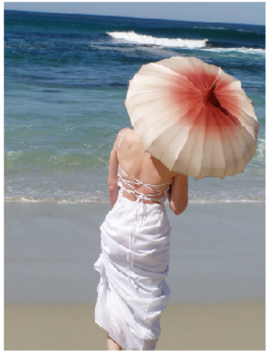
and a pair of long