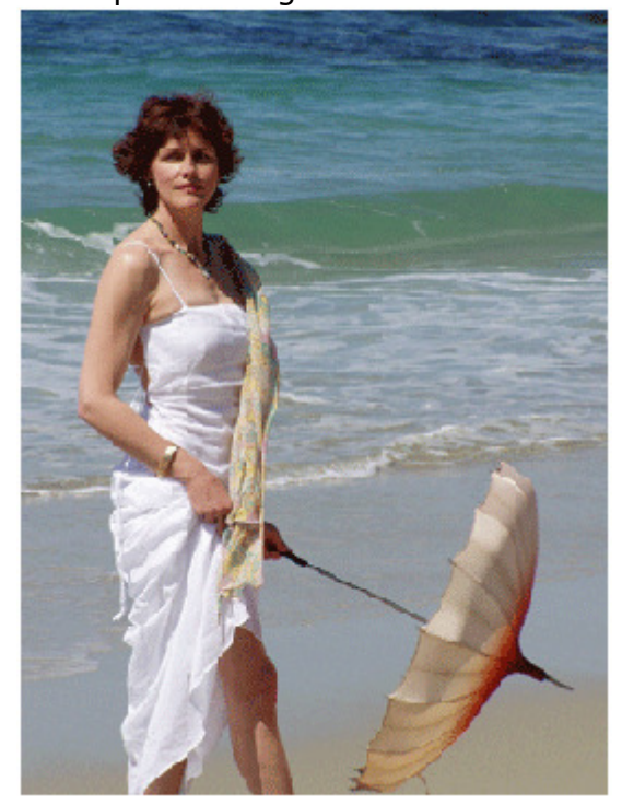
muscular athletic legs