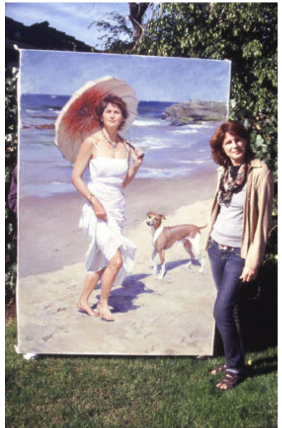
Sexy, beautiful and intelligent. What else do you want to know?