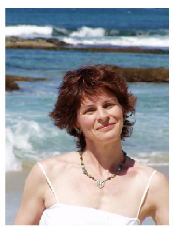
perfectly bilingual, confidently proclaiming,