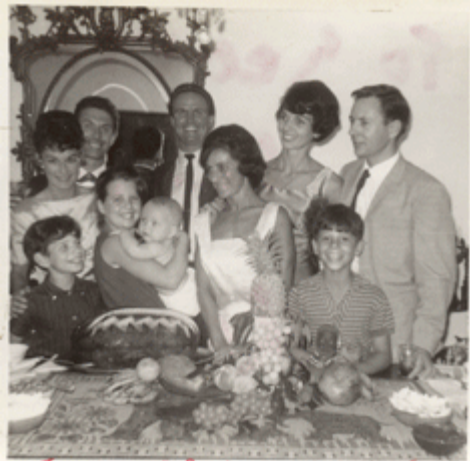
Ice Show Party Dec. 1965