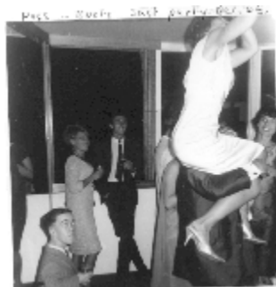
Ice ... Party 1965