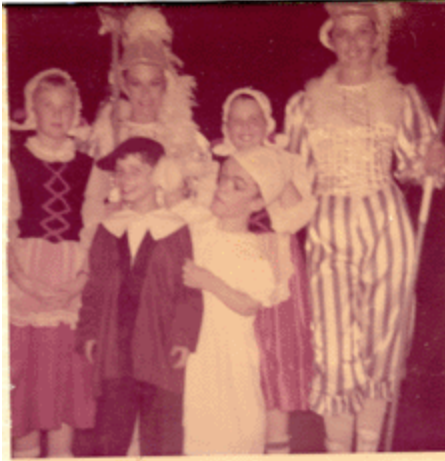
Puss in Boots 1965