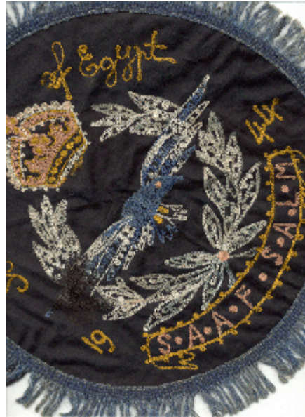
GG learning to fly