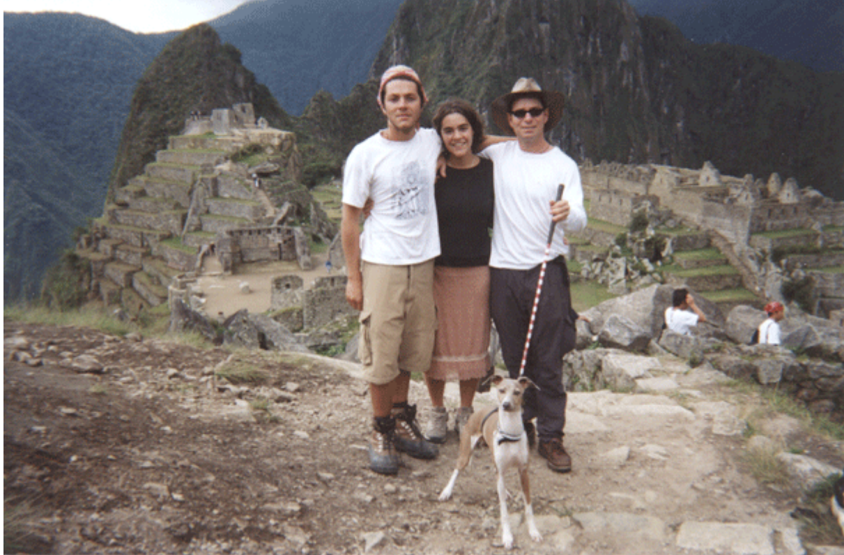
Where I also got to practice my gold swing.