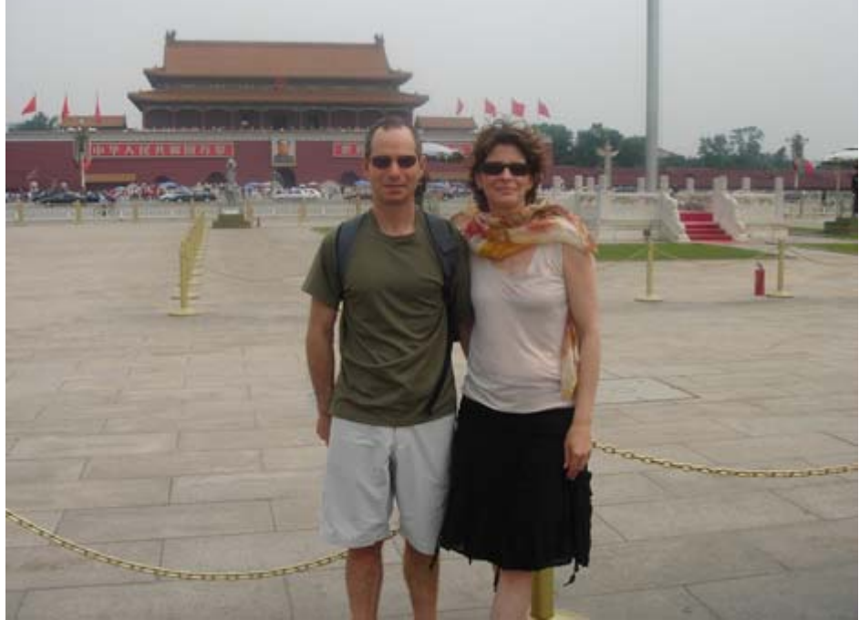
Not to mention following my spring 1989 first visit to China