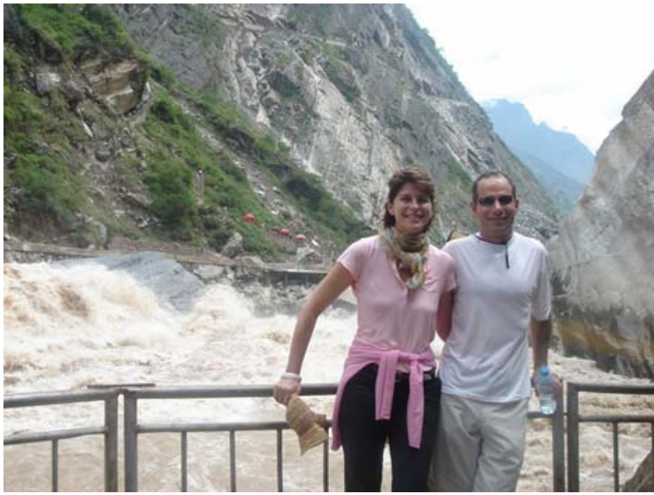
wife's and my 24 day "fact finding mission" to China last summer.